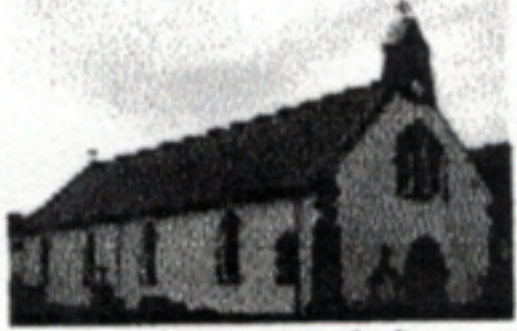
St Patrick's, Craigagh Cushendun